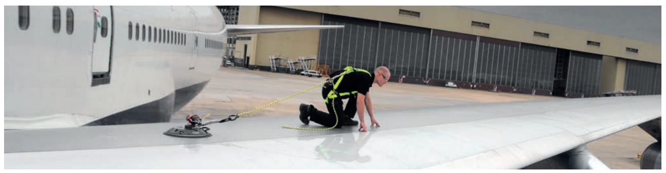
WinGrip AIO System