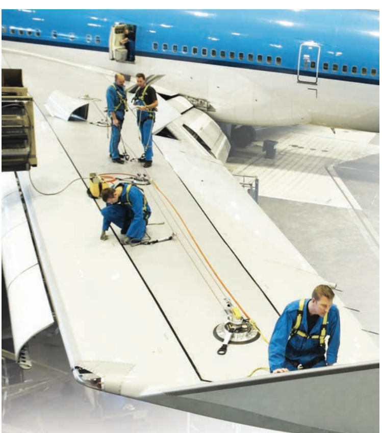
WinGrip Single-User System