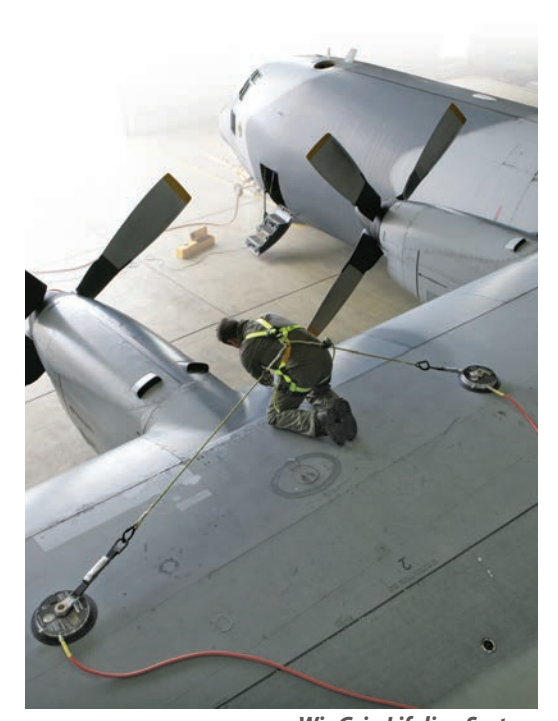
WinGrip Lifeline System