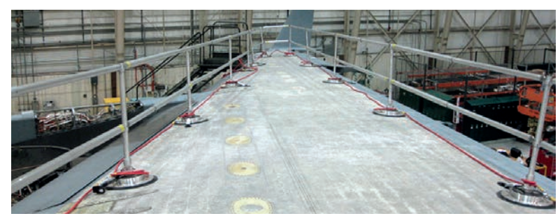
WinGrip Barrier System