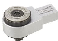
58250004 Fine tooth insert ratchet