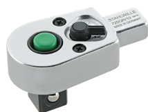
58253004 QuickRelease ratchet insert tool