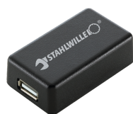
52110061 Interface adaptor