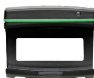
52110220 Bluetooth modules for torque wrench