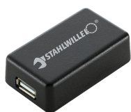
52110061 Interface adaptor