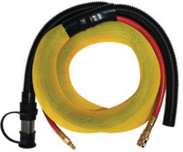
Air/Vac Work Hose Conductive / All Brass Fittings