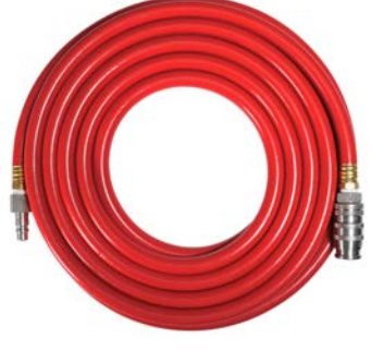
Compressed Air Line Conductive / All Stainless Steel Fittings