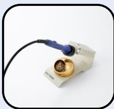
Stand with Tip cleaner #633-01