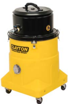
7-Gal Poly Tank