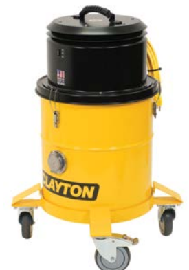
5-Gal Steel Tank