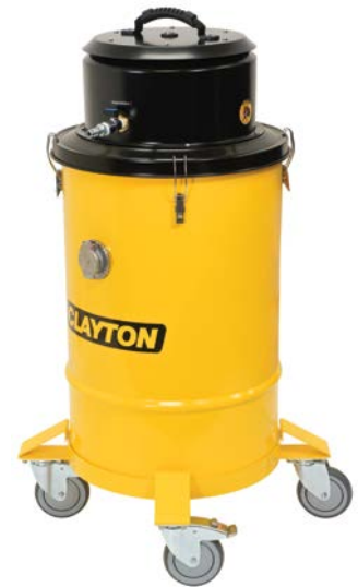
30-Gal Steel Tank