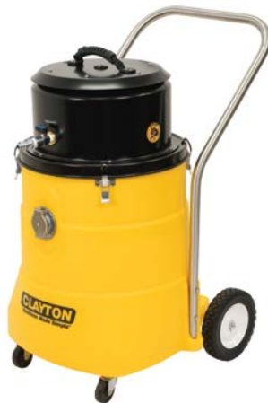
15-Gal Poly Tank