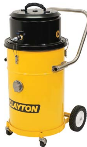
15-Gal Steel Tank