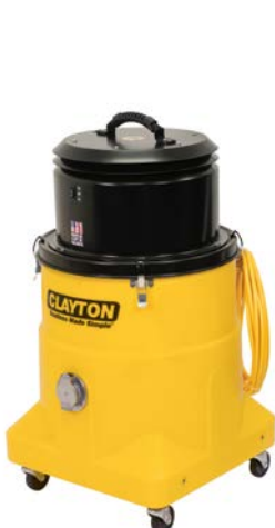
7-Gal Poly Tank