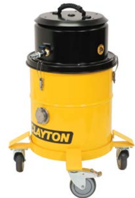
5-Gal Steel Tank