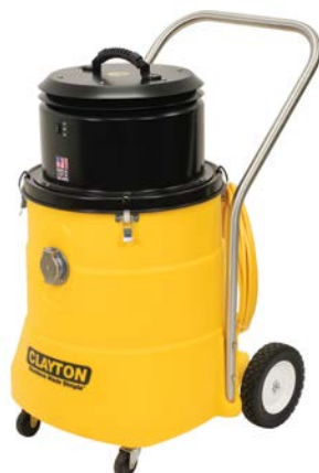
15-Gal Poly Tank