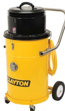
15-Gal Steel Tank