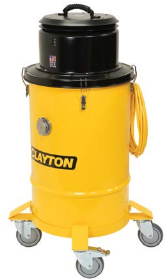
30-Gal Steel Tank