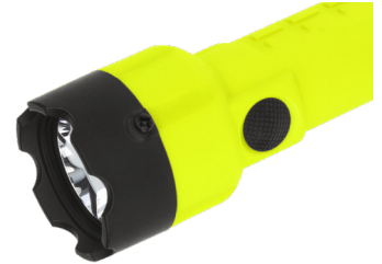
Large, textured button