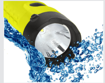
Durable polymer body is impact & chemical resistant