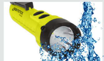
Durable polymer body is impact & chemical resistant