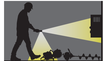
Simultaneous flashlight and floodlight operation