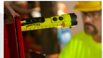
Powerful base magnet allows "hands-free" use